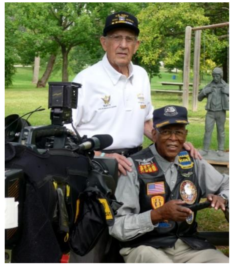
This photo was taken during the Fox 2 interview at the future home of The Michigan WWII Legacy Memorial.

The 2016 recipients of The Victory Award are: