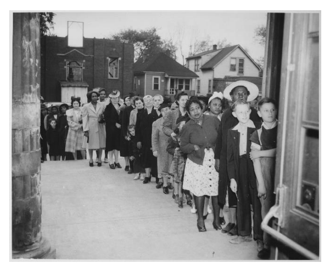
A line for sugar rationing during WWII.

Remember, nothing is rationed in 2016. Bid on auction items to your heart's content!